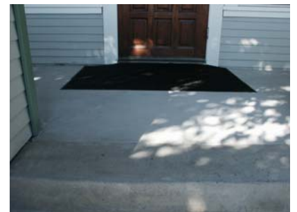
The same door after build up and resurfacing.