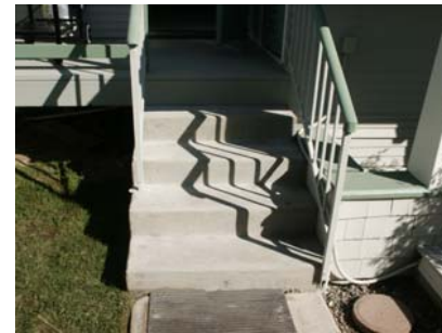
Back stairs get renewed.

Along with the exceptional paint job, our Church also received other upgrades and repairs. These pictures speak volumes.