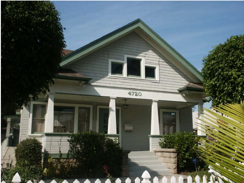
Our Church benefits from a beautiful paint job and a new color scheme!