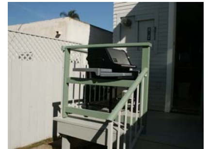
A barbeque for many, many future functions.